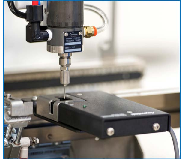
Optional Needle Sensor Module