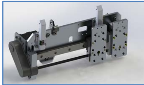
Dual-Simultaneous Programmable Pitch