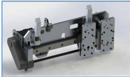
Dual-Simultaneous Programmable Pitch

For more information, speak with your local representative or contact your regional office.