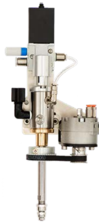
SC-280N Film Coater with Fourth Axis

Programmable applicator modes – spots, lines, and area coverage – provide powerful coating results. The SC-280 ensures a consistent fan pattern – even after idle – through the unique design that circulates heated fluid through the applicator extension maintaining a consistent nozzle