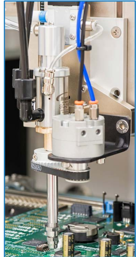
SC-280C Film Coater