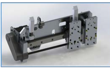
Dual-Simultaneous Programmable Pitch