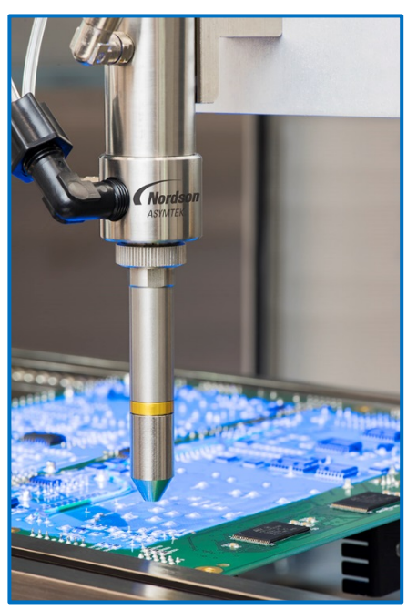
SC-350 Select Spray

The SC-350 applies less air pressure to achieve a tighter edge tolerance providing increased selectivity and control near keep out zones and reduced "cobwebbing" of solvent-based fluids. Lower air assist pressure improvements provide added flexibility within your process parameters – achieving thinner coating results at faster coating speeds for a wide range of fluid viscosities.